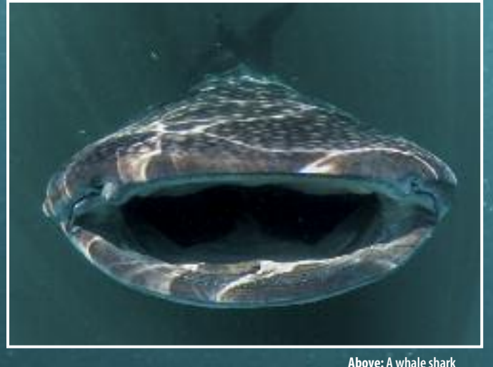
glides up from the depths.