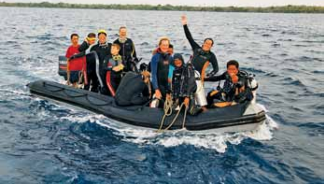
Returning from another amazing dive

"The trips to the Forgotten Islands are for true explorers and those divers seeking out something new and unusual, taking you from one secret paradise to another"